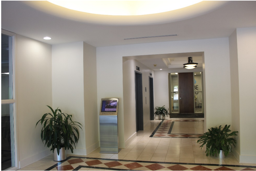
Suite A 2,741 RSF